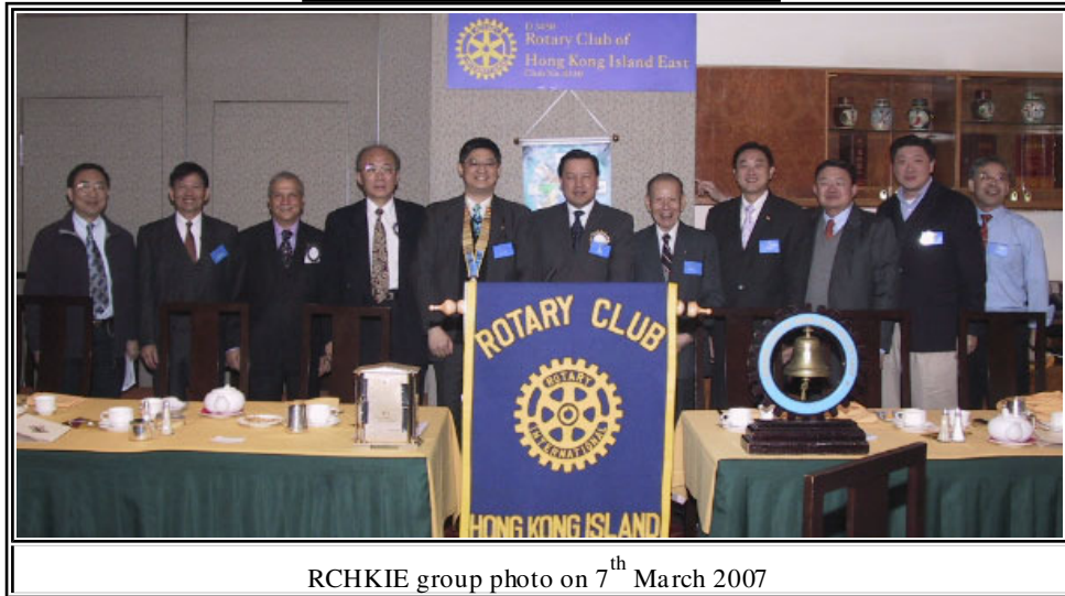
RCHKIE group photo on 7 th March 2007