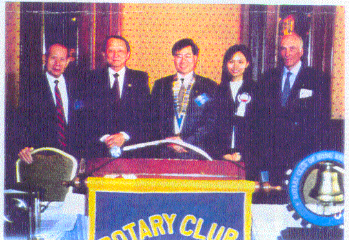
Group photo on March 27, 2002