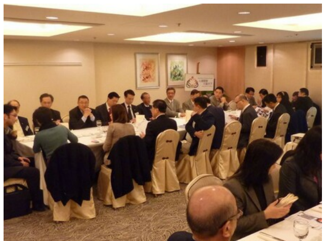
Some luncheon photos - Full House