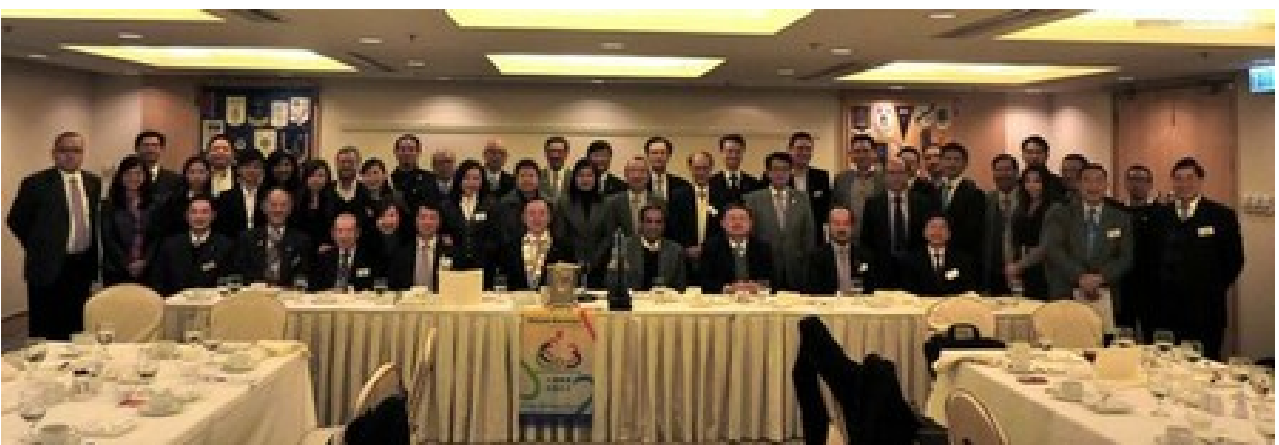
Group photo with members, guest speakers & visiting guests.