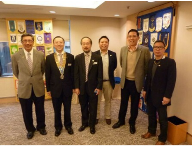
Members from City Northwest HK visited our Club's luncheon meeting.