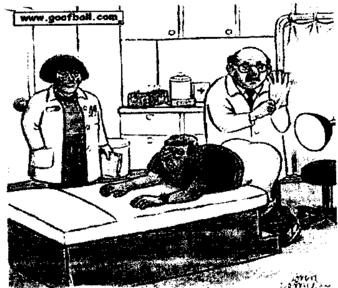
Don't be embarrassed. You think your first guy whose wife shoved the remote up his ass?

"I'd like her for the night." "I'm sure you would, sir," said the Madam. Then gesturing to an 85-year old woman in the corner, "but according to the Union rules, Ethel there has Seniority."