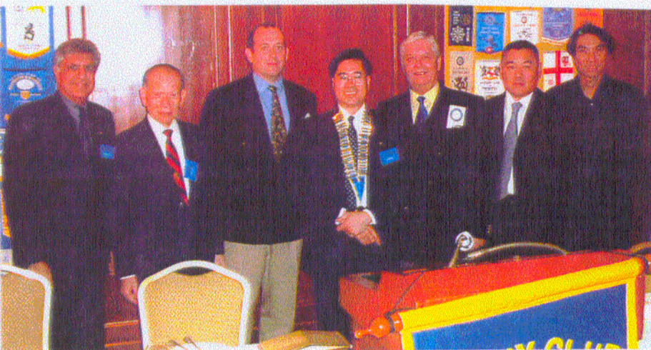
Group photo on March 20, 2002