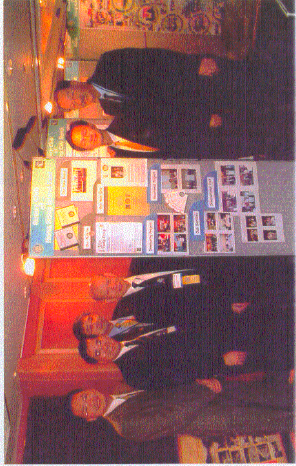
Island East put up an award winning display in the House of Friendship