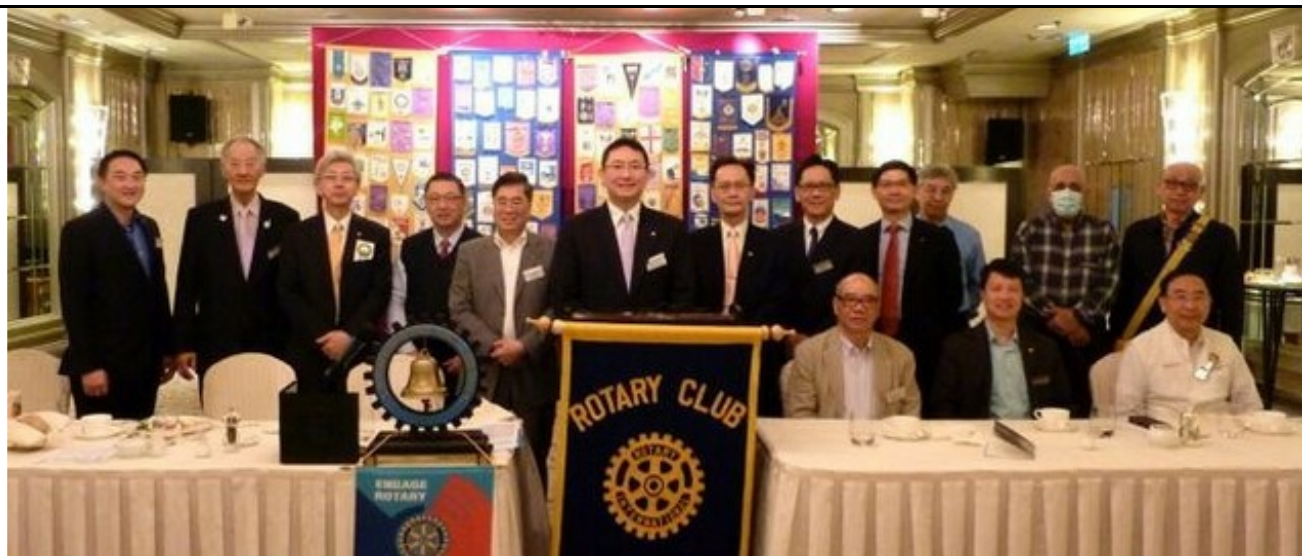
Group photo of members & guest speaker.