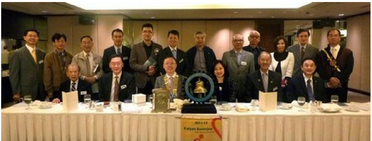
Group photo with members, guest speaker & visiting guests.