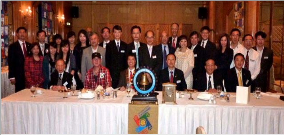
Group photos with members, guest speaker, Rotaractors & guests