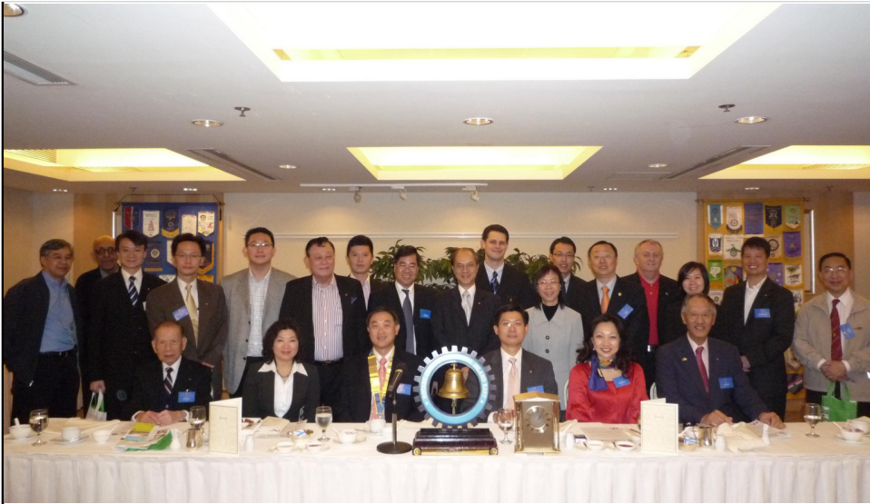
Group photo with guest speaker, visitors, visiting Rotarian, & Members