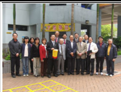
Group photo taken at the playground of the Choy Chun School