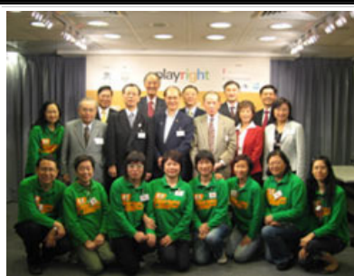
Playright - Group picture with Playright staff, volunteer workers and delegates from Rotary Clubs of Osaka Jonan and HK Island East