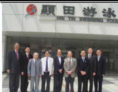
Group photo taken in front of the swimming pool building near Choy Chun School