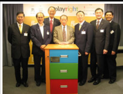
Playright - Group picture of delegates from the Rotary Club of HK Island East