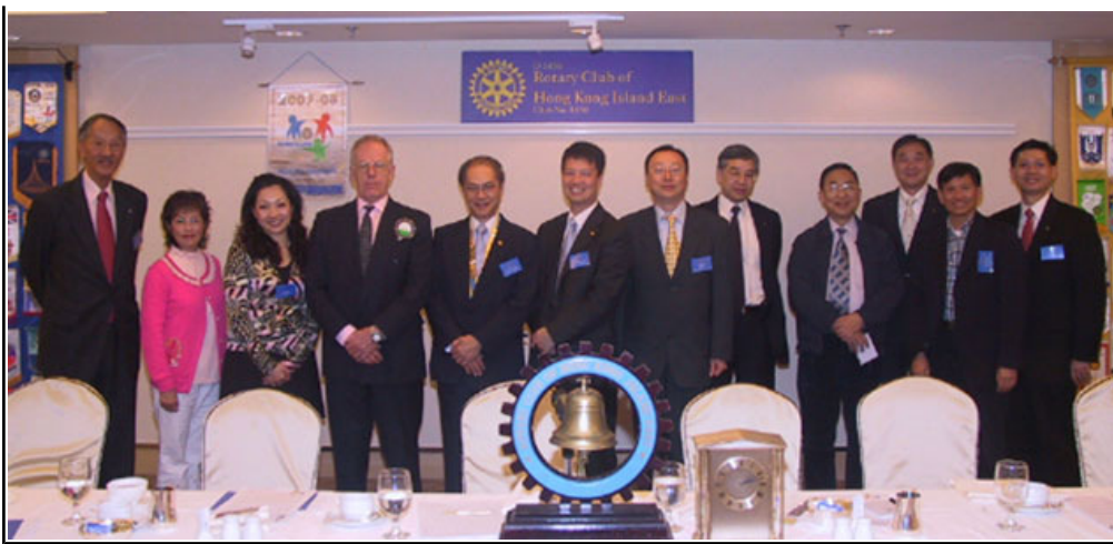
Group Photo with members, visiting guests & speaker