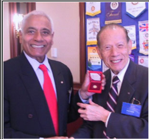
See what happens when you show up at our weekly meeting? You win!! Come again PP Taj.