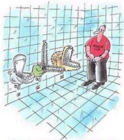
Men's room in AdventureLand