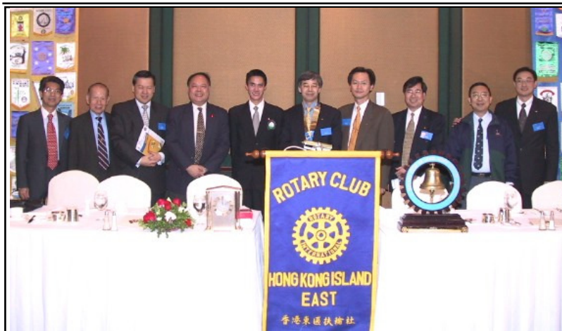
Group Photo on March 17th, 2004