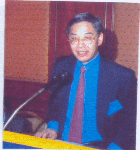
VP Rudy leading the Club Assembly discussion.