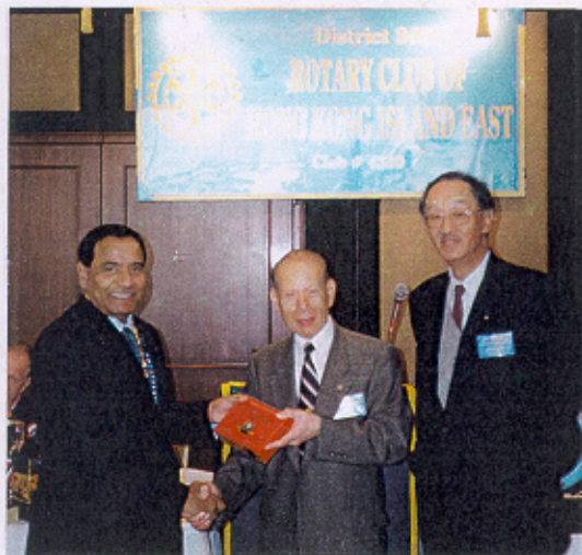
Pres Taj also received the longest drive award.