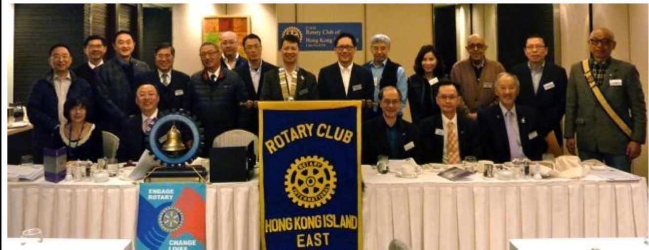
Group photo with members & visiting Rotarian