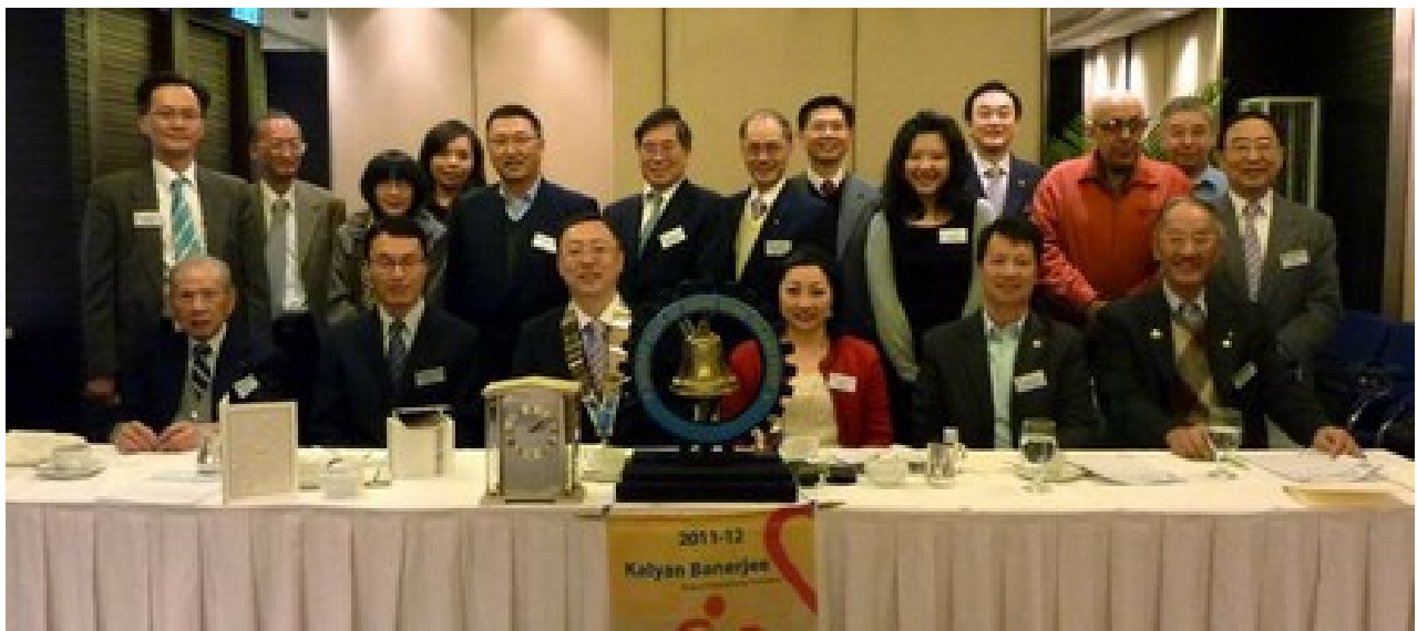
Group photo with members, visiting Rotarian & guest.