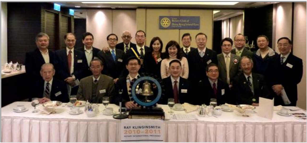
Group photo with members & visiting guests