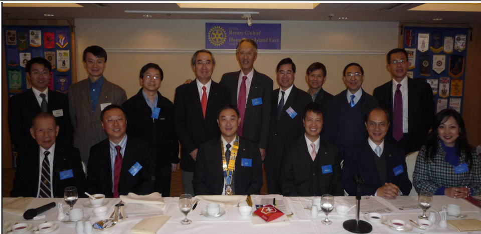
Group photo with visiting Rotarian & members