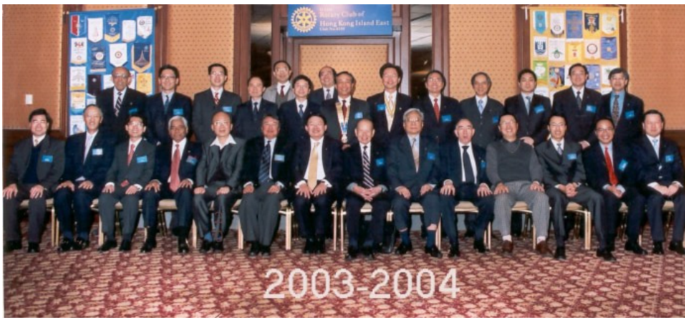
Our group photograph for the 50th anniversary bulletin.