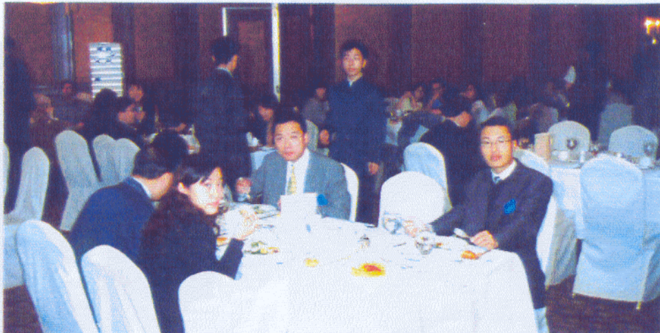
This meeting was well covered by the press as shown here in this photo of our members with the media in the background.