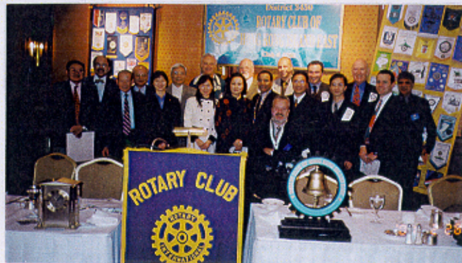
Picture of all the visiting Rotarians from Hong Kong Harbour On 28 th February, 2001