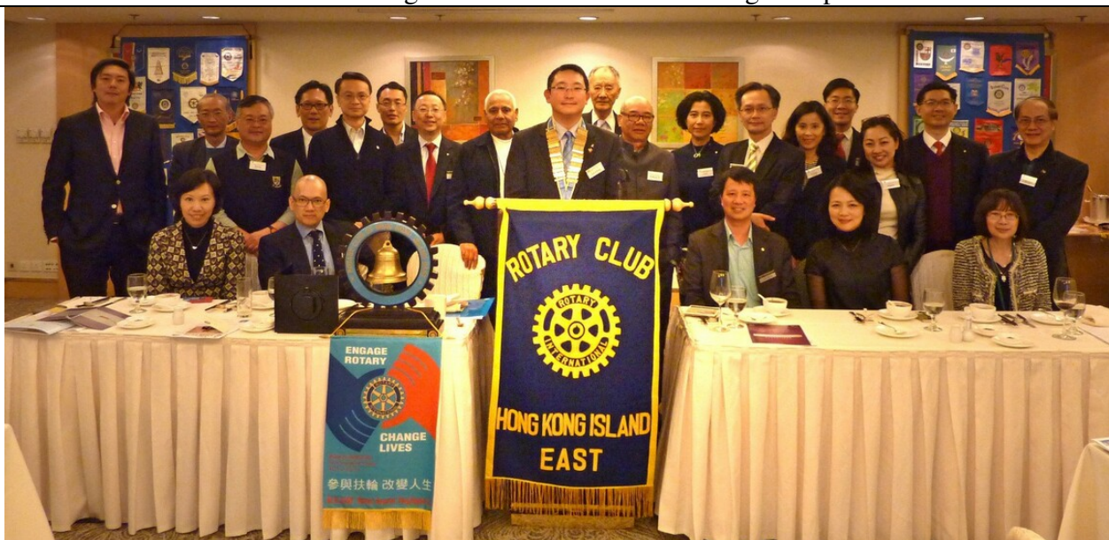
Group Photo of our meeting on 26 th Feb., 2014