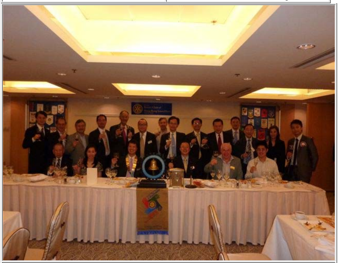
Group photos with members, visiting guest & guest speakers