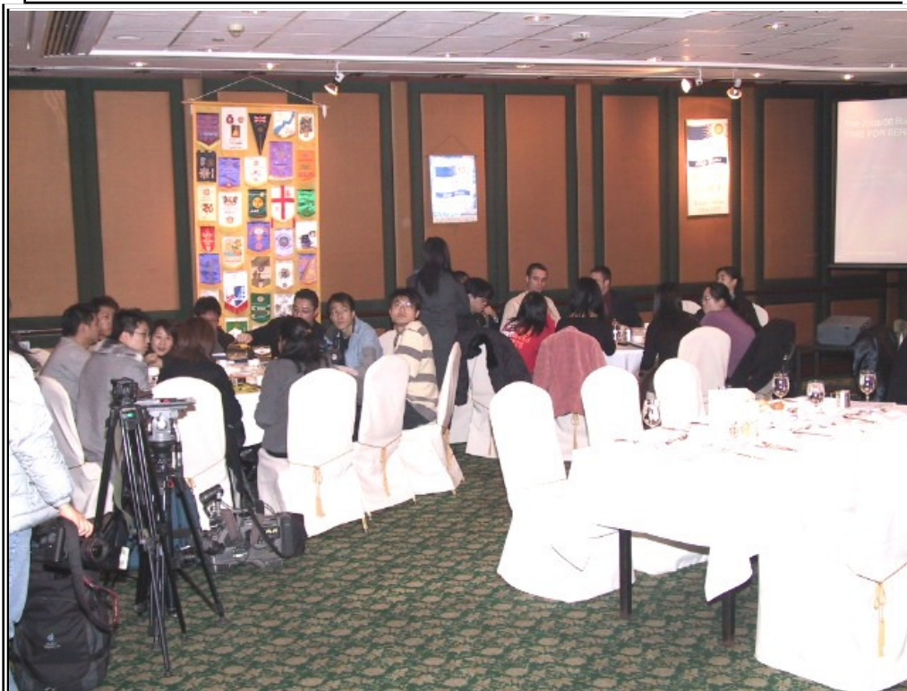
The press were out in force.