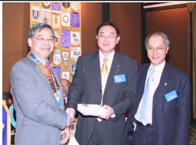
Our birthday boy this week was none other then our Director