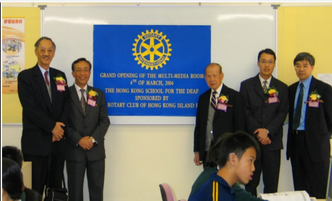
Picture of the opening of the Multi-Media Room with our members present. Below is the other end of the room