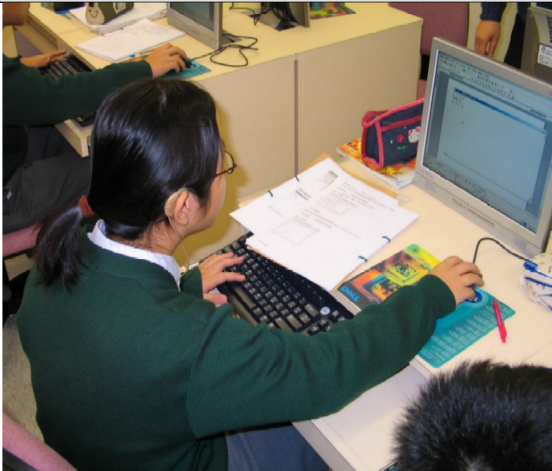
A student using the computer with LCD Monitor all provided by our club.