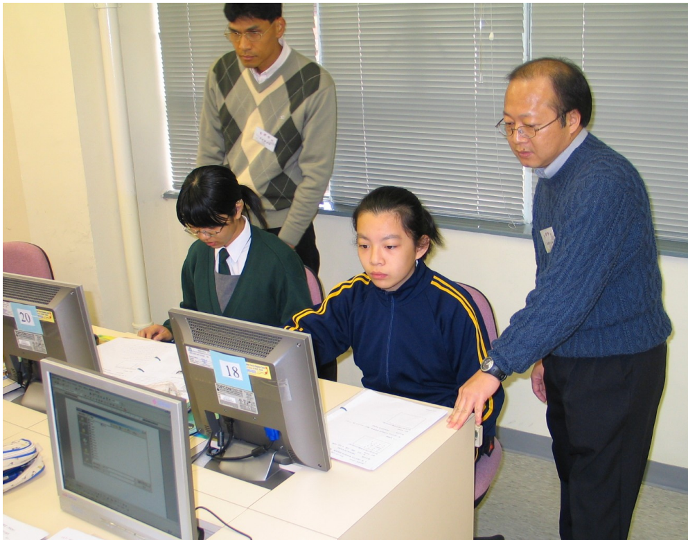
Two instructors watching over the student.