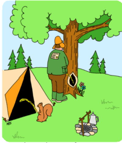
The Balance of Nature http://www.UnlikelyStories.com

answered, "Monday, Tuesday, and Friday would be ideal." The husband said, "I can bring her in on Monday; but on Tuesday and Friday I golf, so she'll have to take the bus."