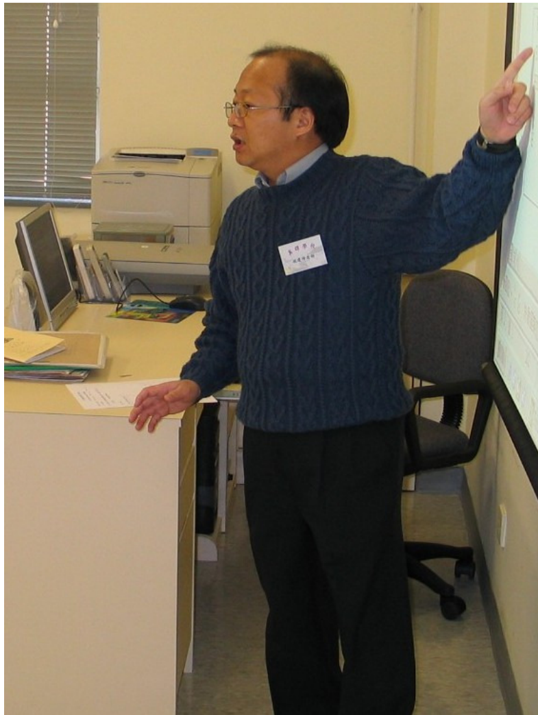
An instructor teaching the students.