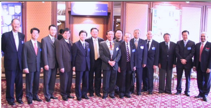
Our PP's present today for our official photograph, here pictured smiling, count them 13 of them plus one President.