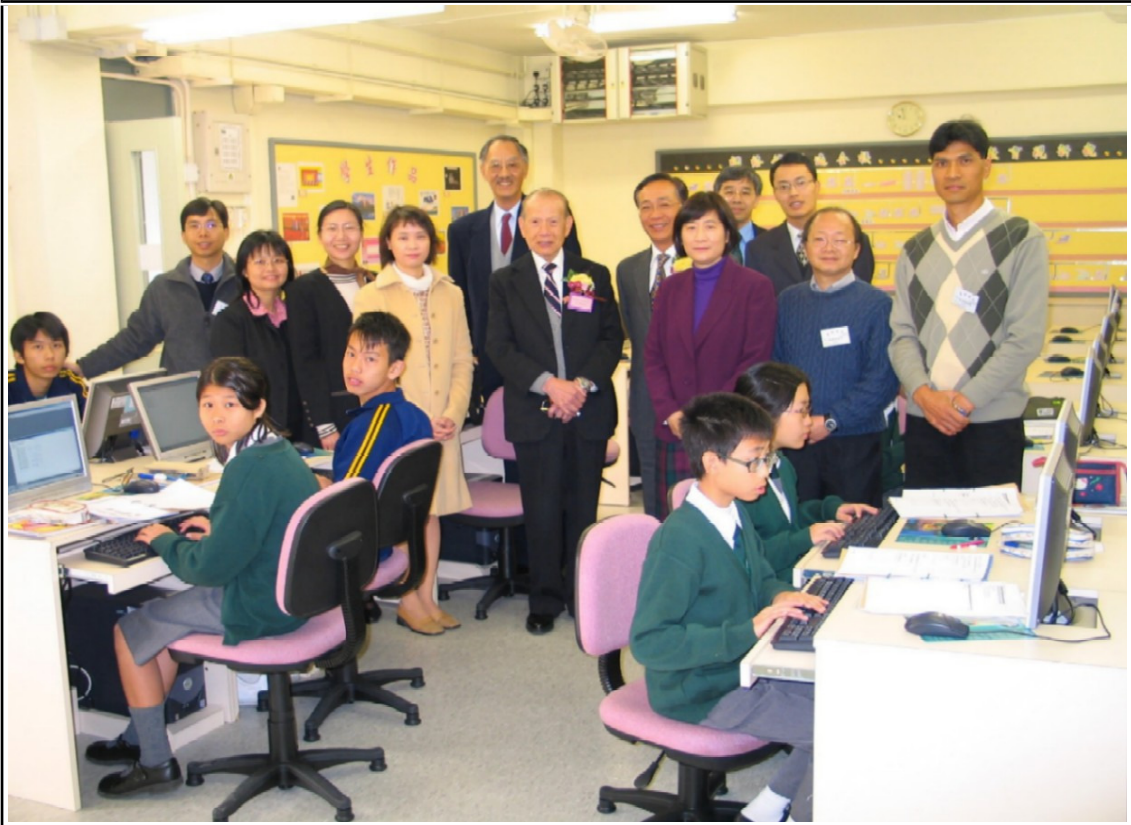
Our members amongst the students and teachers of the Hong Kong School for the Deaf.