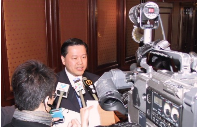
The media was out in force surrounding PP Tim.