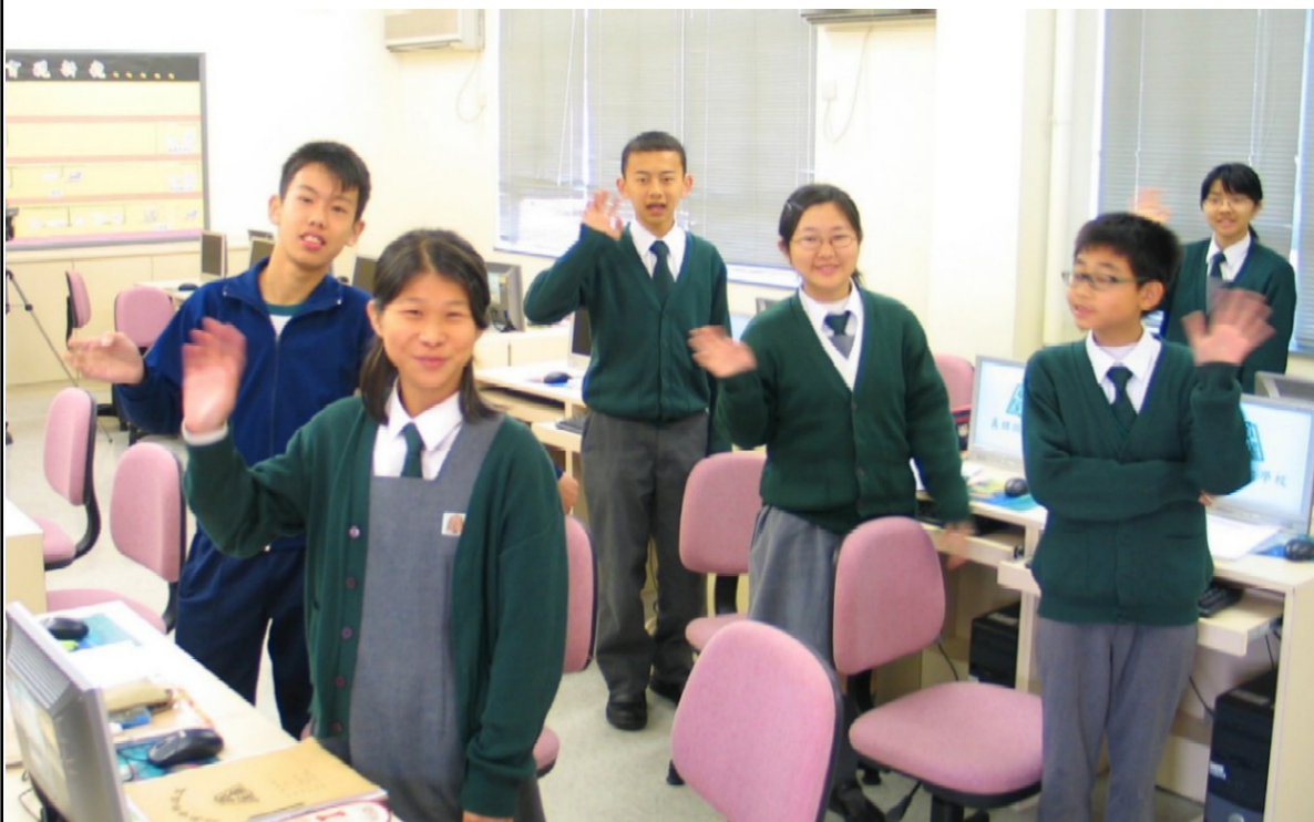
The happy students of The Hong Kong School for the Deaf waving thank you to the Rotary Club of Hong Kong Island East.