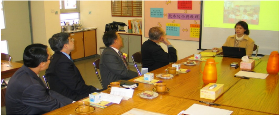
We were briefed on the school activities before we toured the classroom.