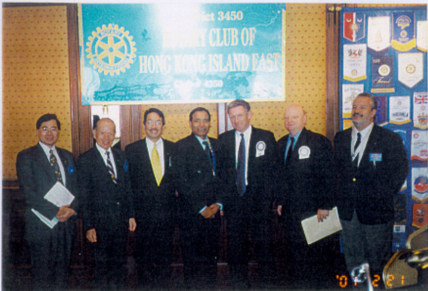
Visitors to the club on 21 February, 2001.