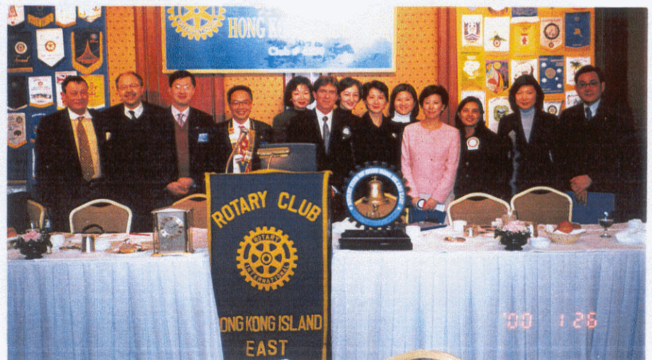
Visitors & guests to the club on 26 th Jan., 2000