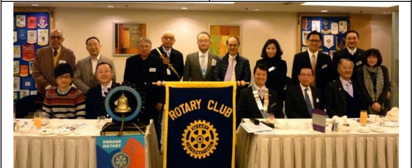
Group photos with members, visiting Rotarians & Rotractor