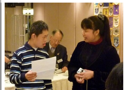
Choi Jun School Students shared some of their daily lives with our members