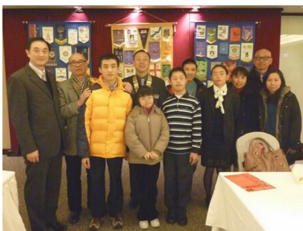
Project photo of Choi Jun School students, teachers, project Person In Charge & sponsors.