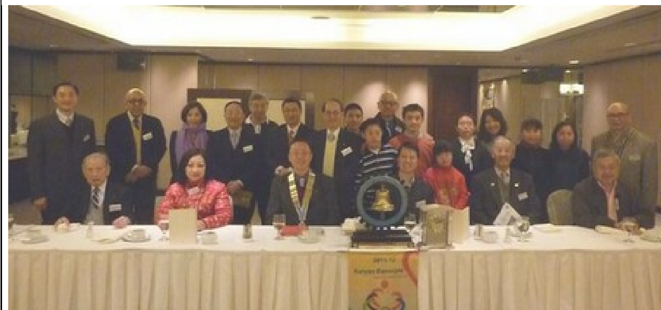
Group photo with members, Choi Jun School teachers & students