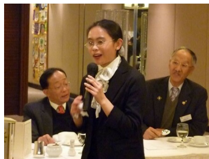
Choi Jun school students gave some introductions of themselves