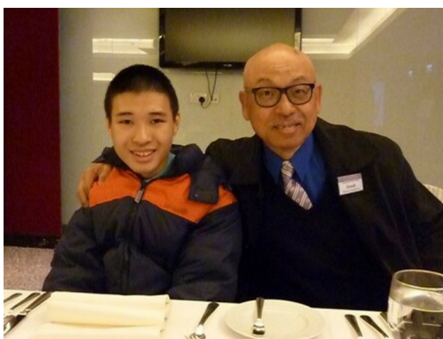
Choi Jun School students took photo with some of our members