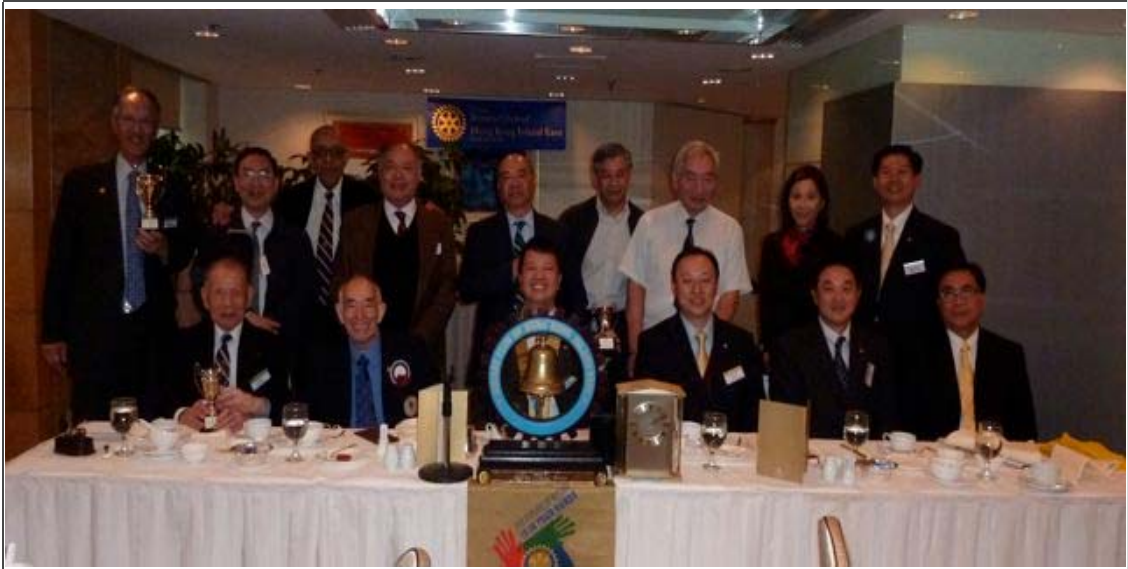
Group photos with members, visiting Rotarians & guests