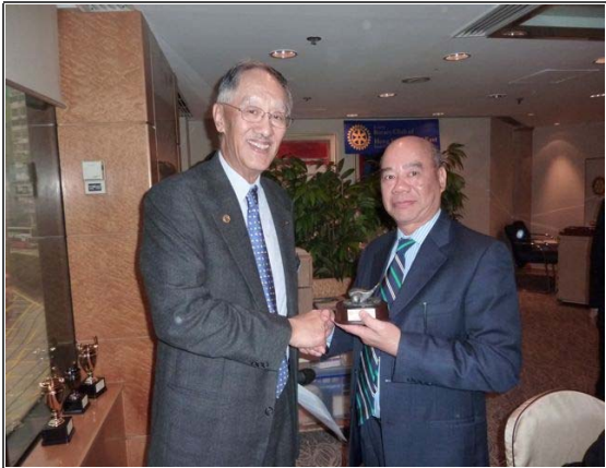
Visiting guest won the shortest drive on hole #9