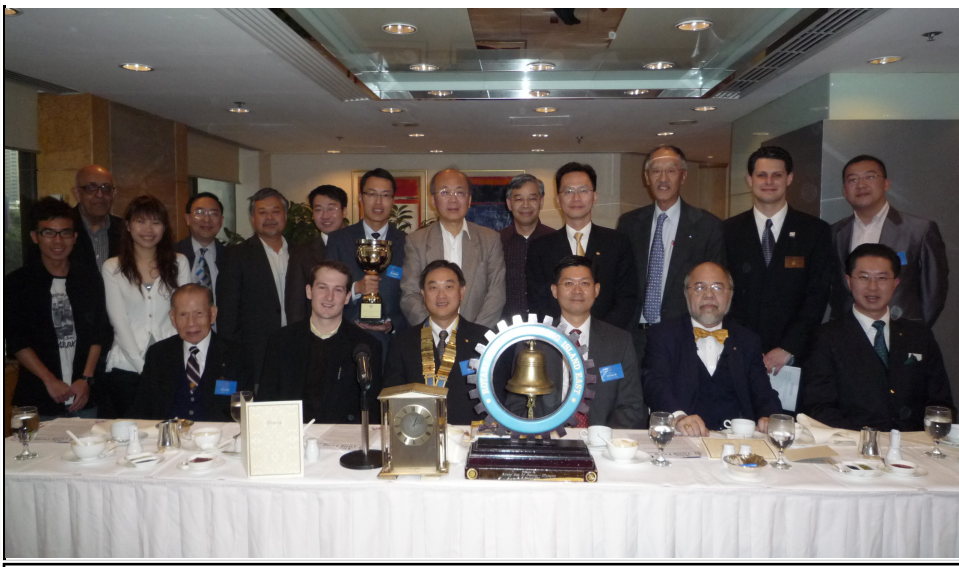
Group photo with visiting Rotarians, Ambassadorial Scholars, Rotaractors and members