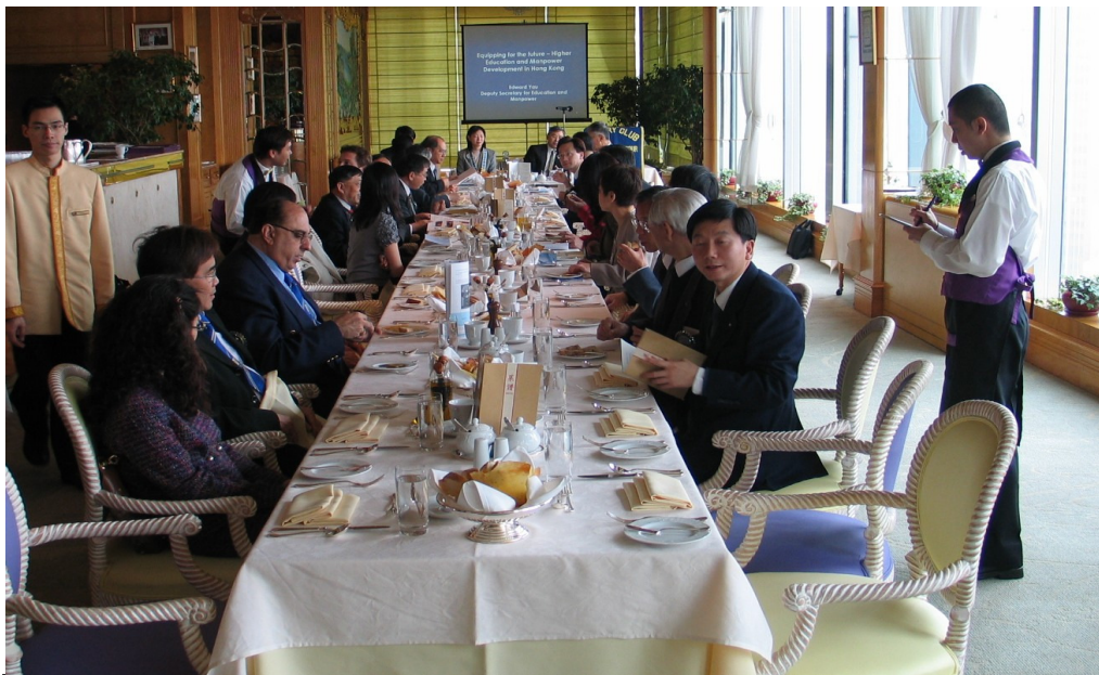
A Panoramic view of the gathering showing the Looong Table not quite full but soon were fully occupied..