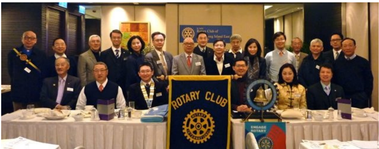
Group photos with members & visiting Rotarian