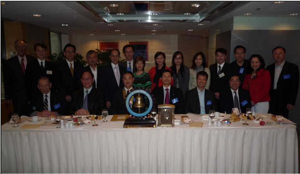
Group photo of our members taken with visiting Rotaractors, visitors & Speaker