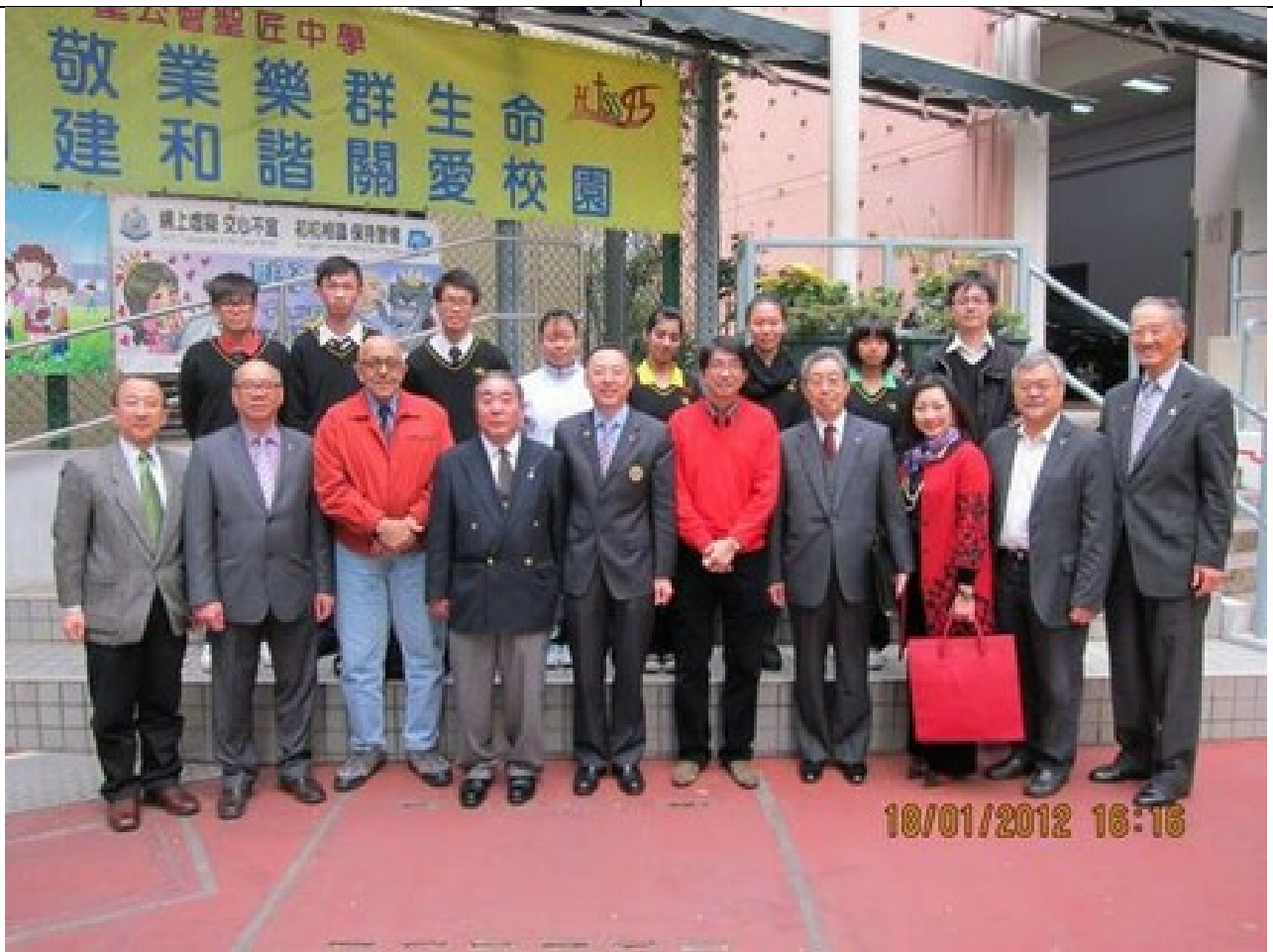
Group photo with Rotary Club members, school Principal, teachers & students.