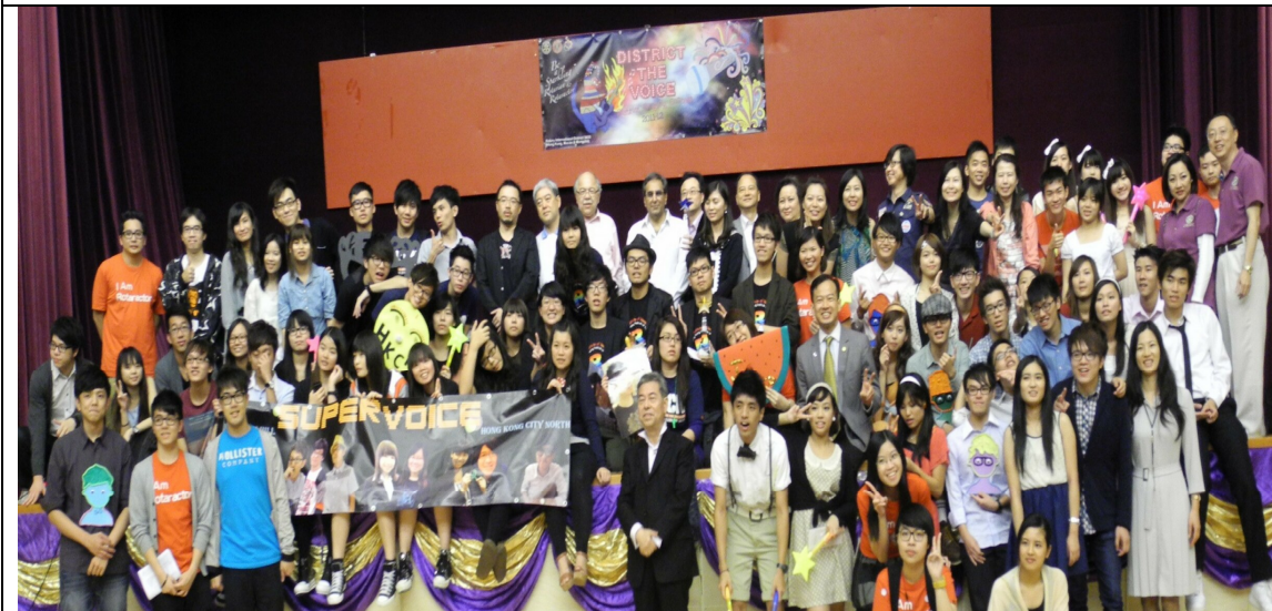
Oct 29 Rotarian and Rotaractor Singing Contest