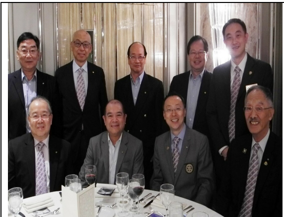
October 28 Vocational Award Dinner – RC HK North East Members