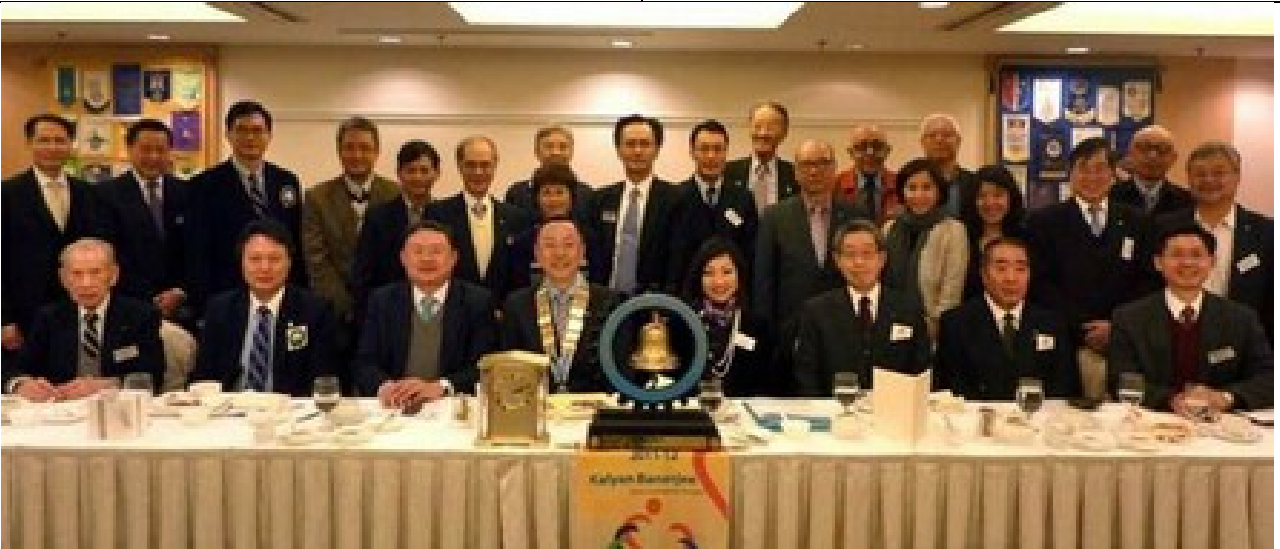
Group photo with all members, visiting Rotarians & guests.