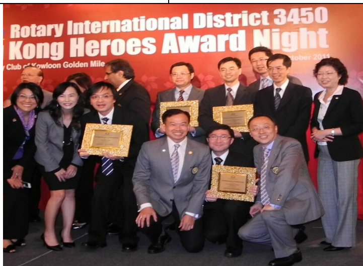
October 28 Vocational Award Dinner