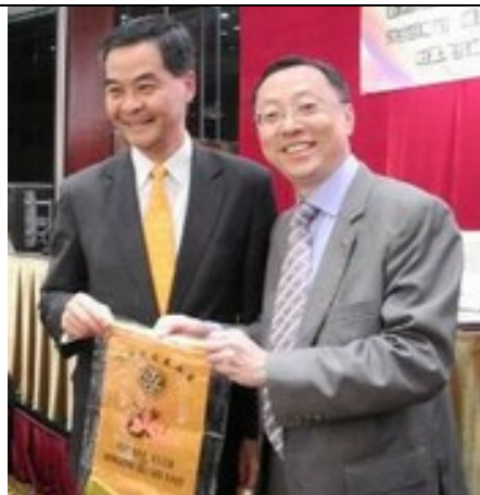
RC Tolo Harbour and her members