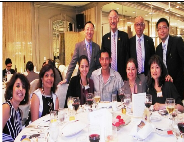
October 28 Vocational Award Dinner – RC Kowloon Golden Mile Members