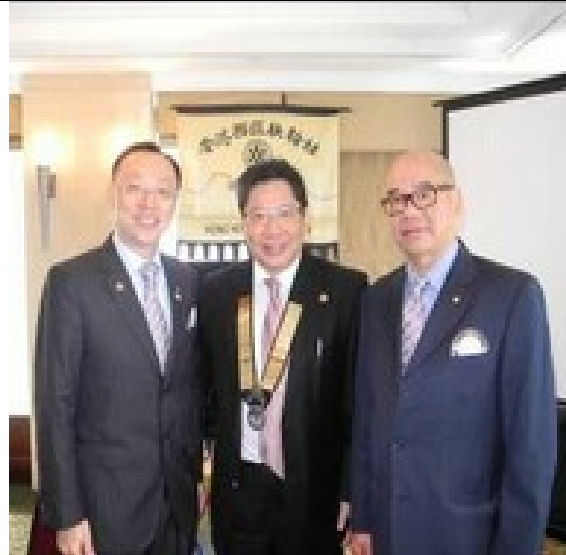
October 7 RC HK Island West Visit – Pres. Norman Yeung (middle)