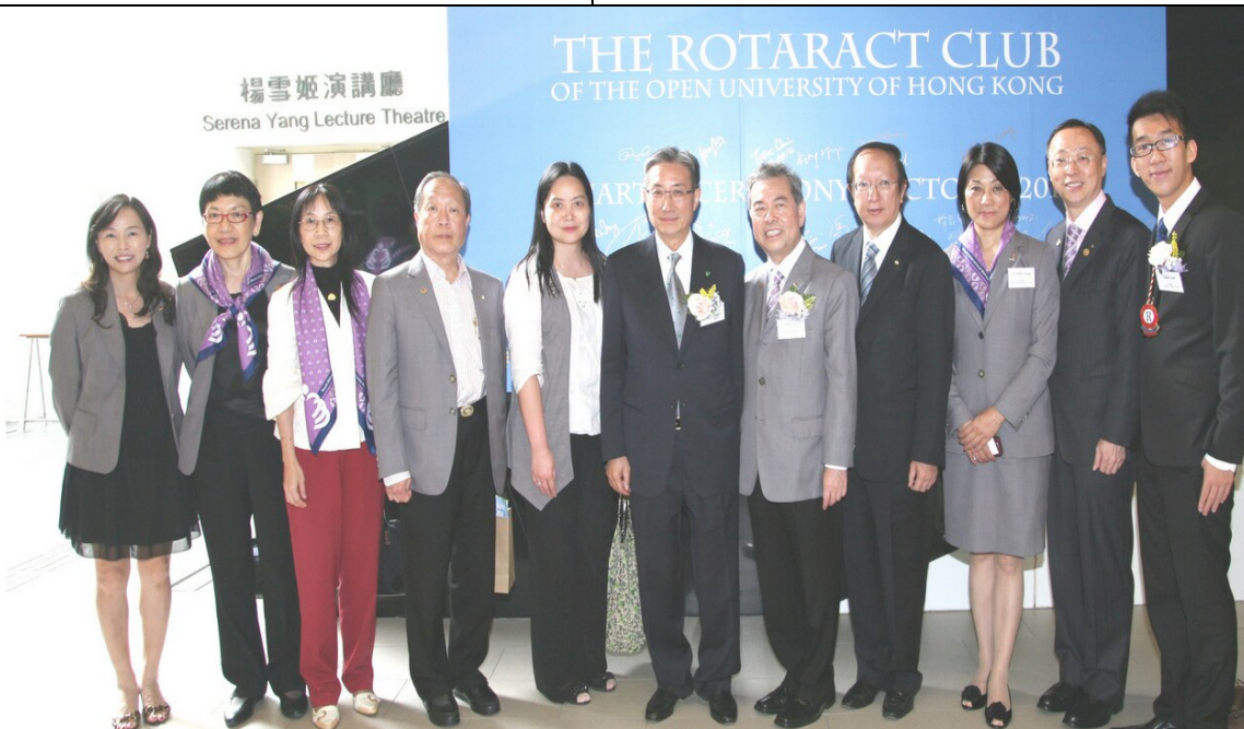
Oct 8 Rotaract Club of Open University Charter Ceremony