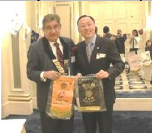
October 20, 2011 RC of Kowloon Visit – Pres. Obe MOHAN (L)