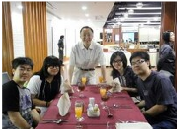
October 22, 2011 '818 Photograph workshop' – Holy Carpenter Students