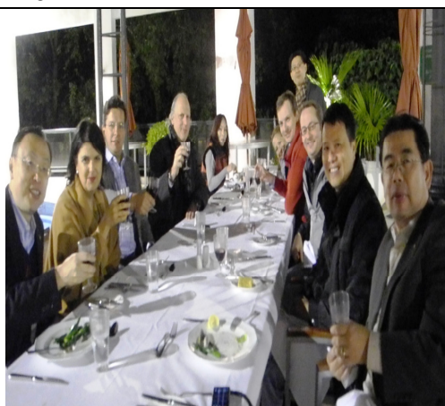
Dec 2, Deep Water Bay BBQ Dinner – Members from RC Kowloon Golden Mile