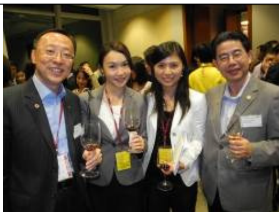
November 23, Wine Tasting Committee Chair Charter Pres. Fonia RC Central (R2)