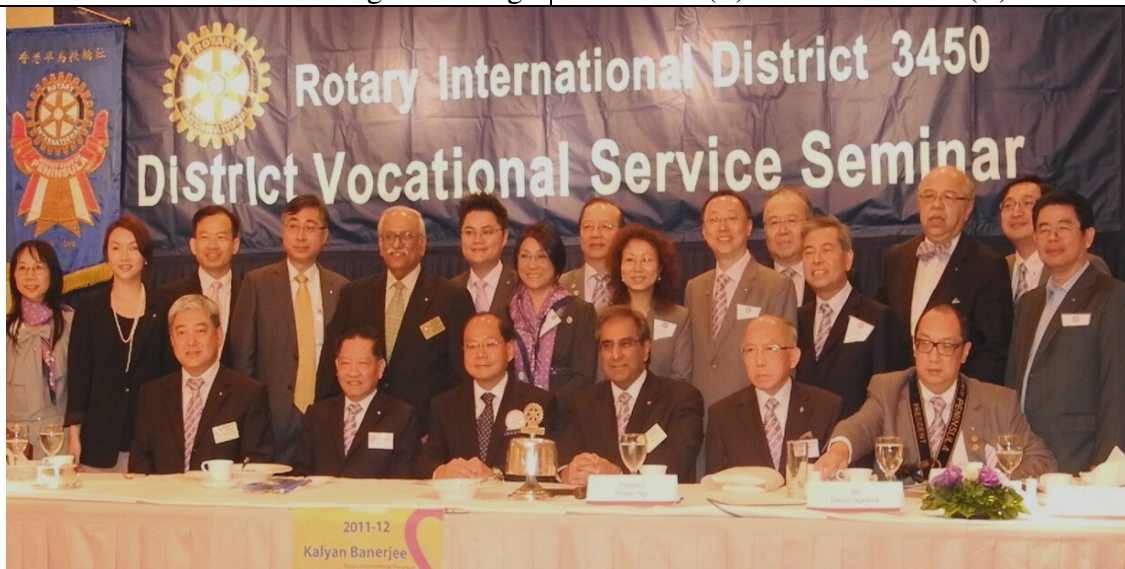
October 25 District Vocational Lunch with Commissioner of Police Tsang Wai Hung