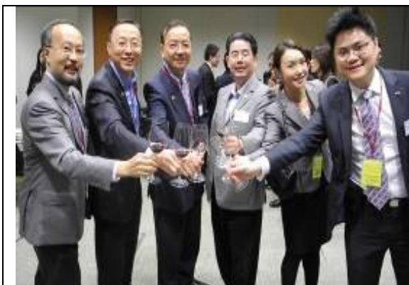
November 23, 2011 Wine Tasting 6 Presidents