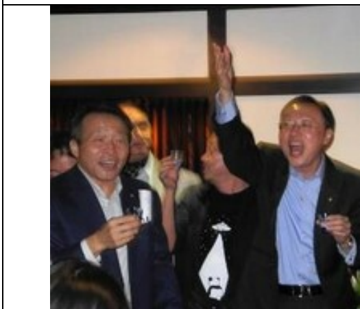
November 26, 2011 818 Sake Wine Tasting Charity Dinner