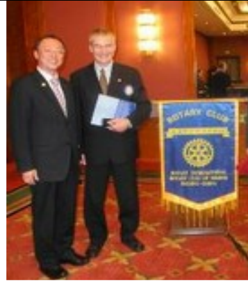
November 9, 2011 RC Beijing Visit