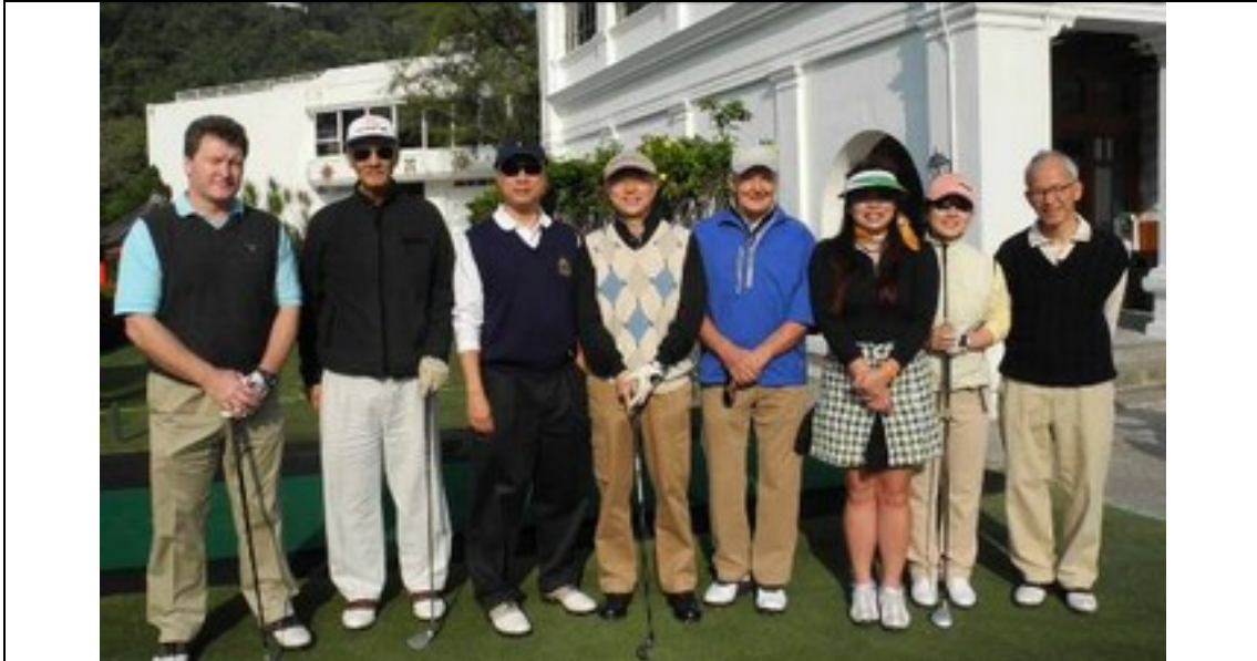
December 22, 2011 Golf day RC Hong Kong South