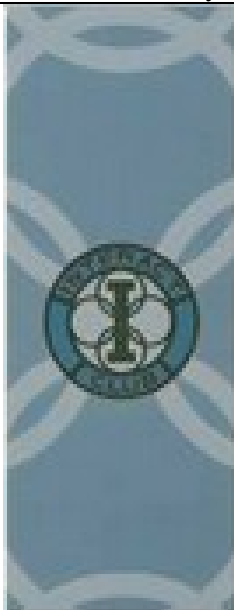
December 15, 2011 Holy Carpenter Secondary School Interact Club Charter Ceremony

Sponsored: Rotary Club of Hong Kong Island East