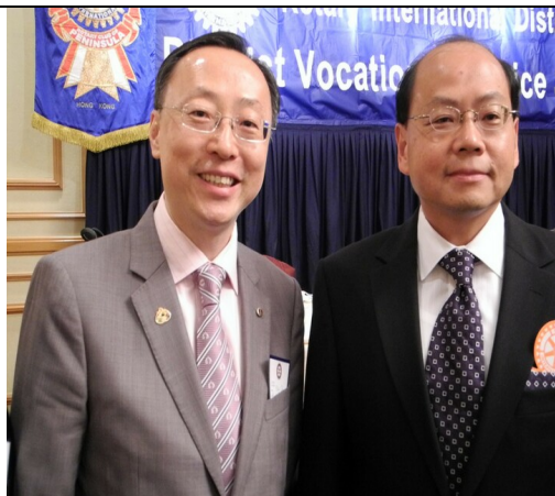
October 25 District Vocational Lunch – Commissioner of Police Tsang Wai Hung