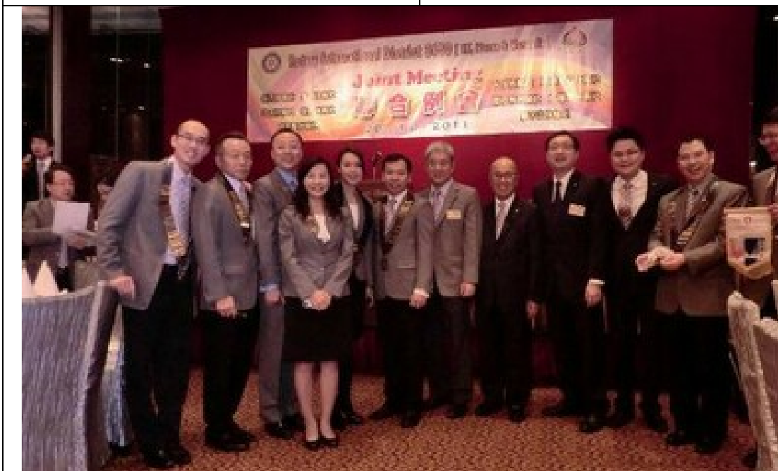
November 28, 2011 Area 6 Joint Meeting