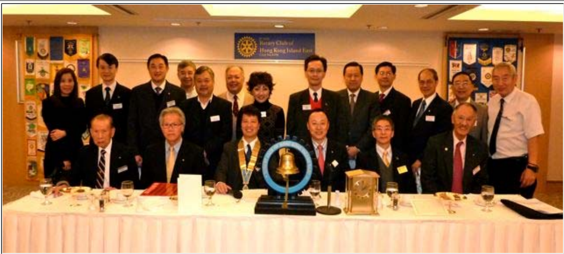
Group photos with members & visiting Rotarian