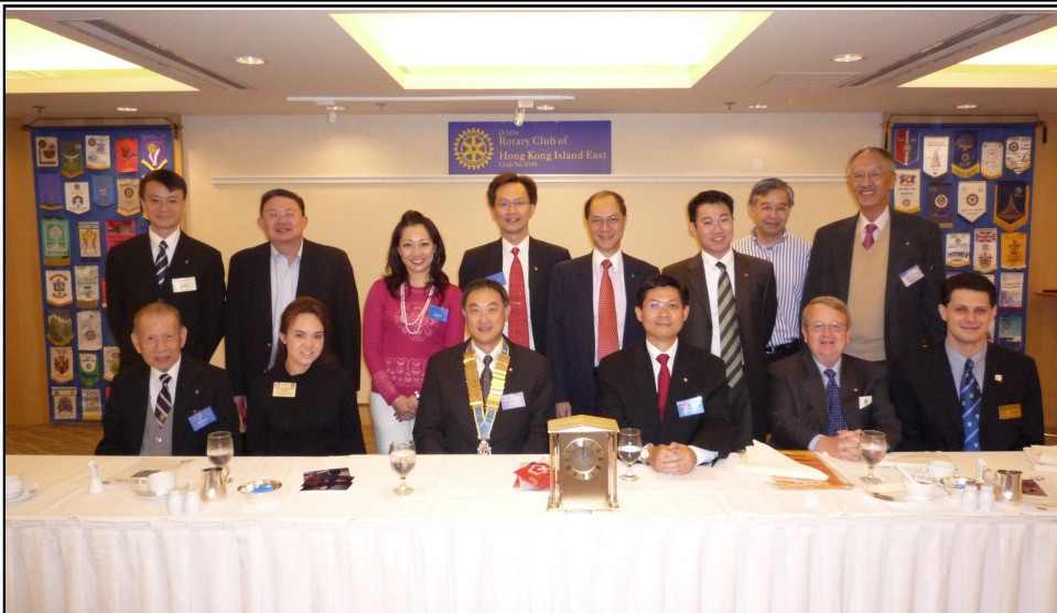
Group photo with visiting Rotarian, Ambassadorial Scholars and members