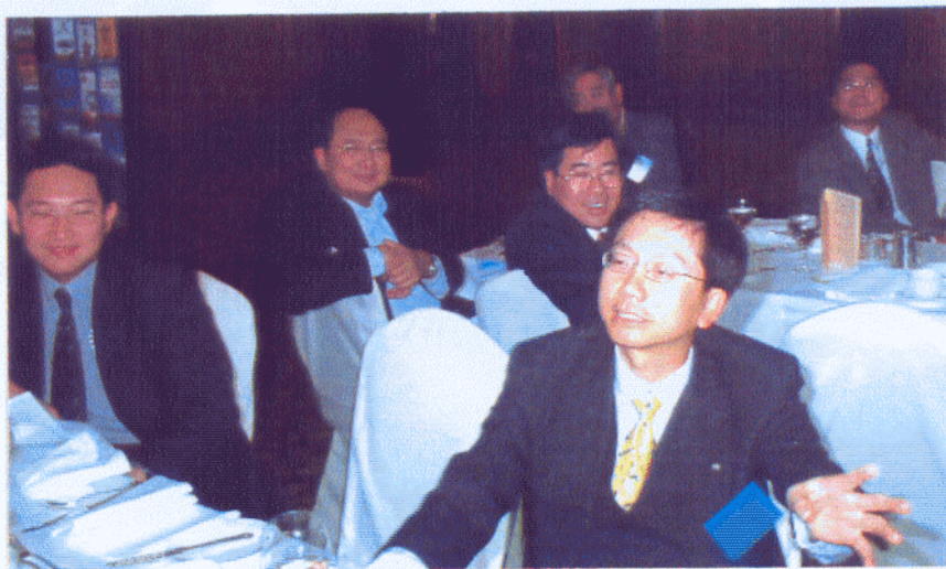
Even PP Li got into the swing of it by answering one of the question.