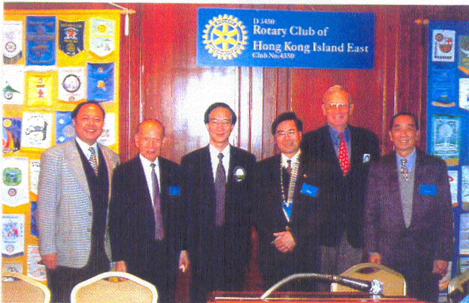
Group Photo of our guest speaker & visitors on 23 rd January, 2002.