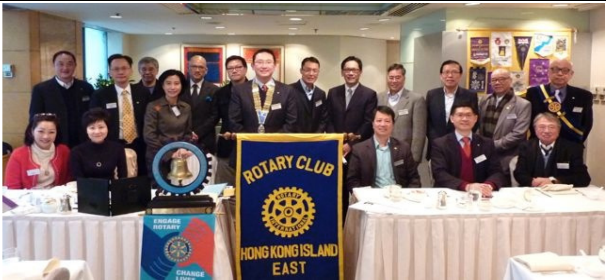
Group photo with member, Guest speaker & visiting guests.