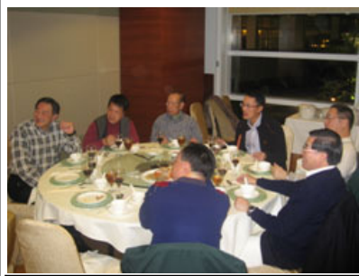
Golfers Table at dinner