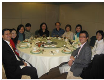
Group Photo after the dinner