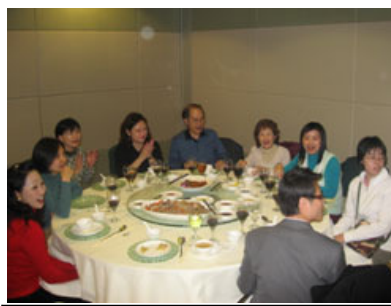
Non-golfers Table at dinner