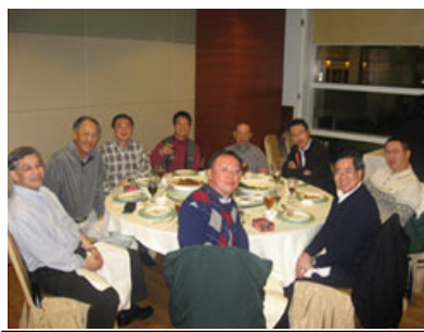
Group picture of all the Golfers