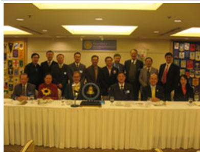
Group photo with speaker, visitors & members