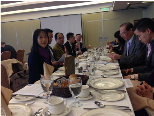
Rotarians from different clubs joined the meeting