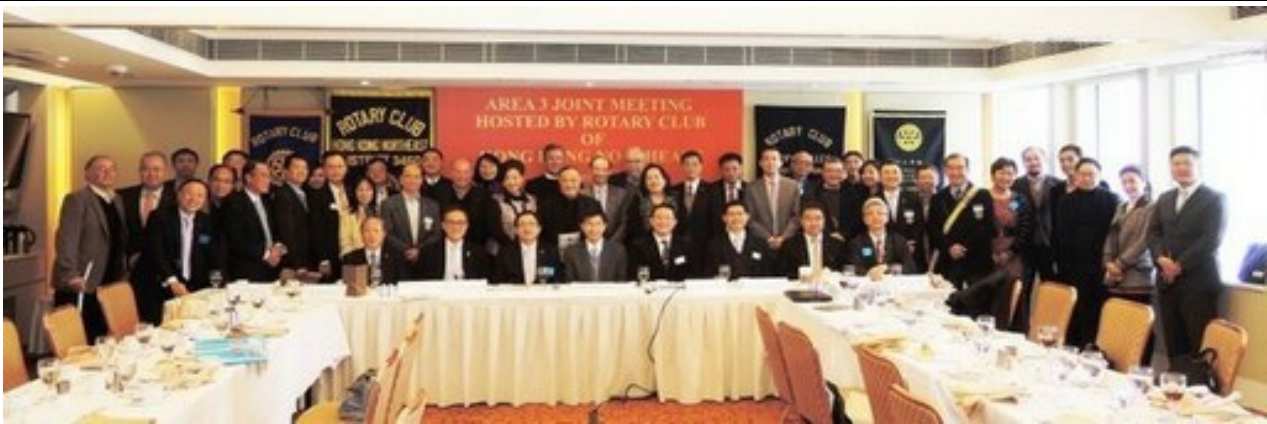
Group photo of Area 3 Clubs Joint Luncheon Meeting

The 4th Hong Kong Bowling Tournament for All Cum The 3rd Hong Kong Blind Bowling Tournament