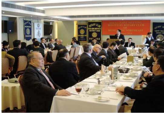
Rotarians from different clubs attended the Joint Area 3 meeting