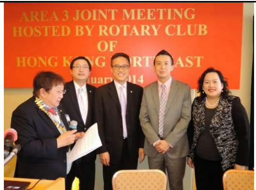
New Member was inducted at the Joint Area 3 Meeting