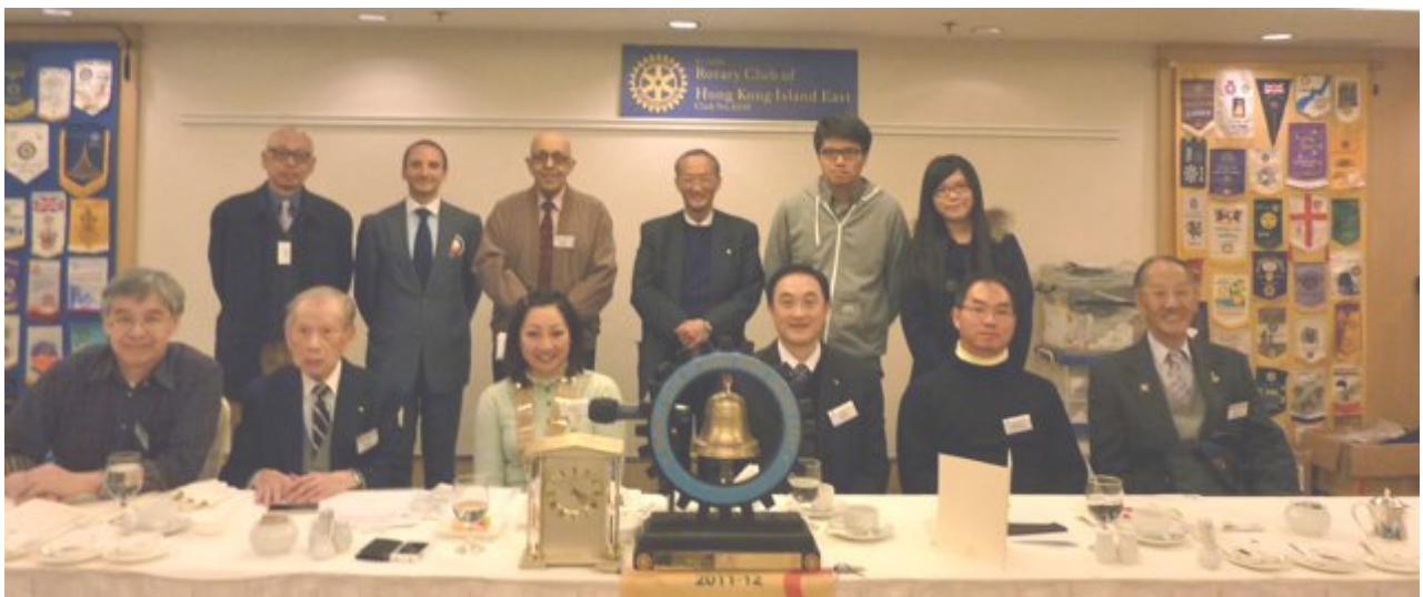
Group photo with members & Rotaractors