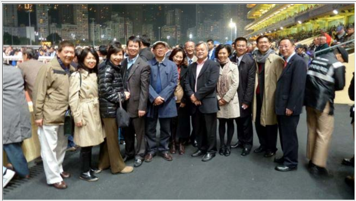
Group photo of all the member of Rotary Club of Hong Kong Island East visiting guests