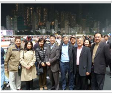
One of the grop photo