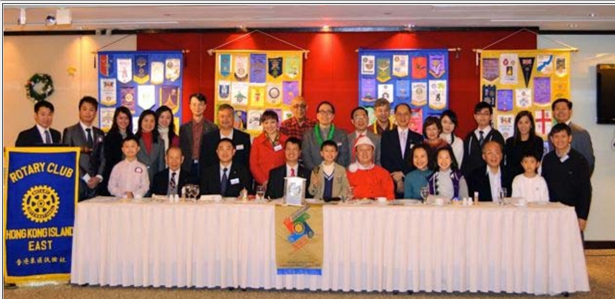
Group photos with members, families members & visiting guests Rotarians