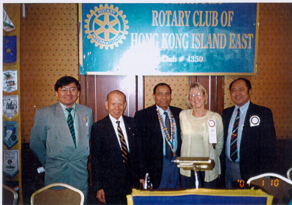
Visitors to the club on 10 th January, 2001.