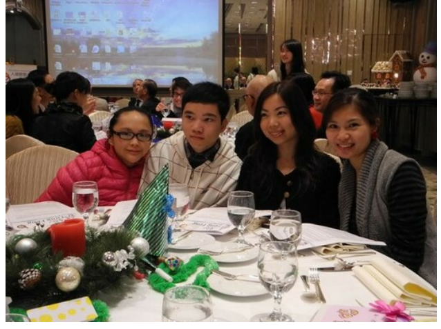
Students & Teachers from Choi Jun School