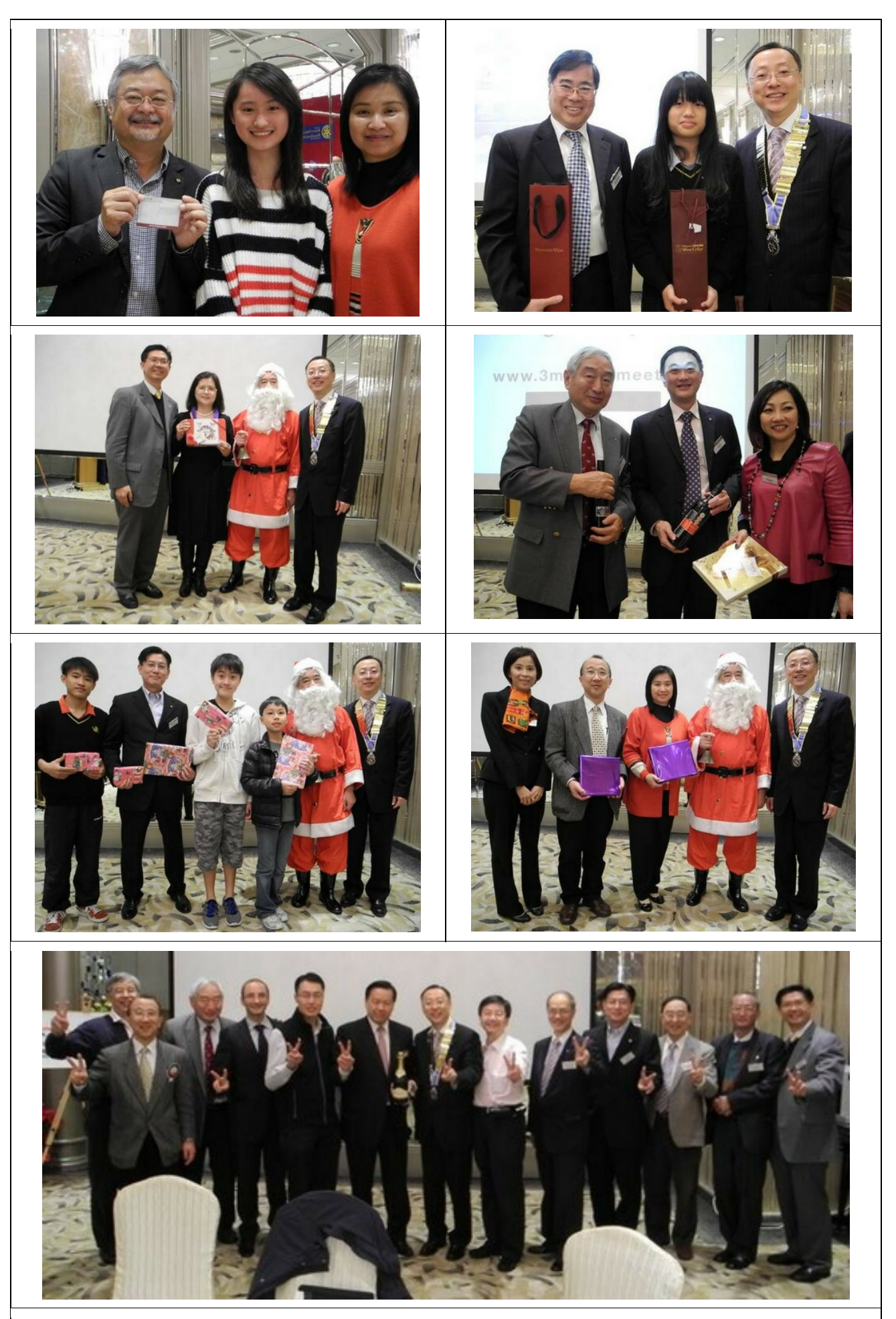
Lucky draw winners of the X'mas party