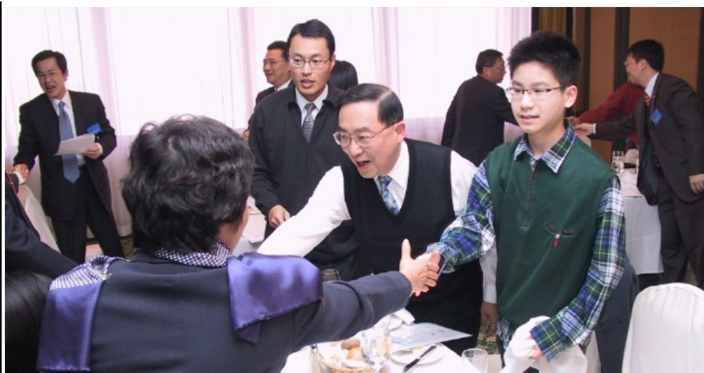
Merry Christmas wishes were exchanged between all members of our club and our guests.