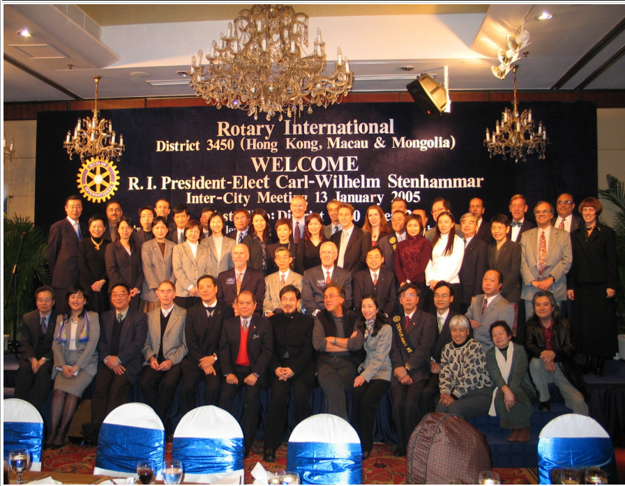
Group Photo of all Areas of District 3450 Rotary club taken with RIPE Stenhammar on the 13th of January, 2005.