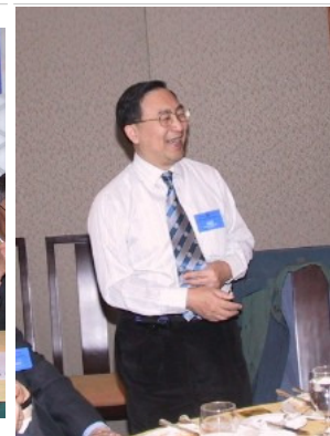
Program Chairman for January telling us what to expect in the rest of this month and how our club is being run.